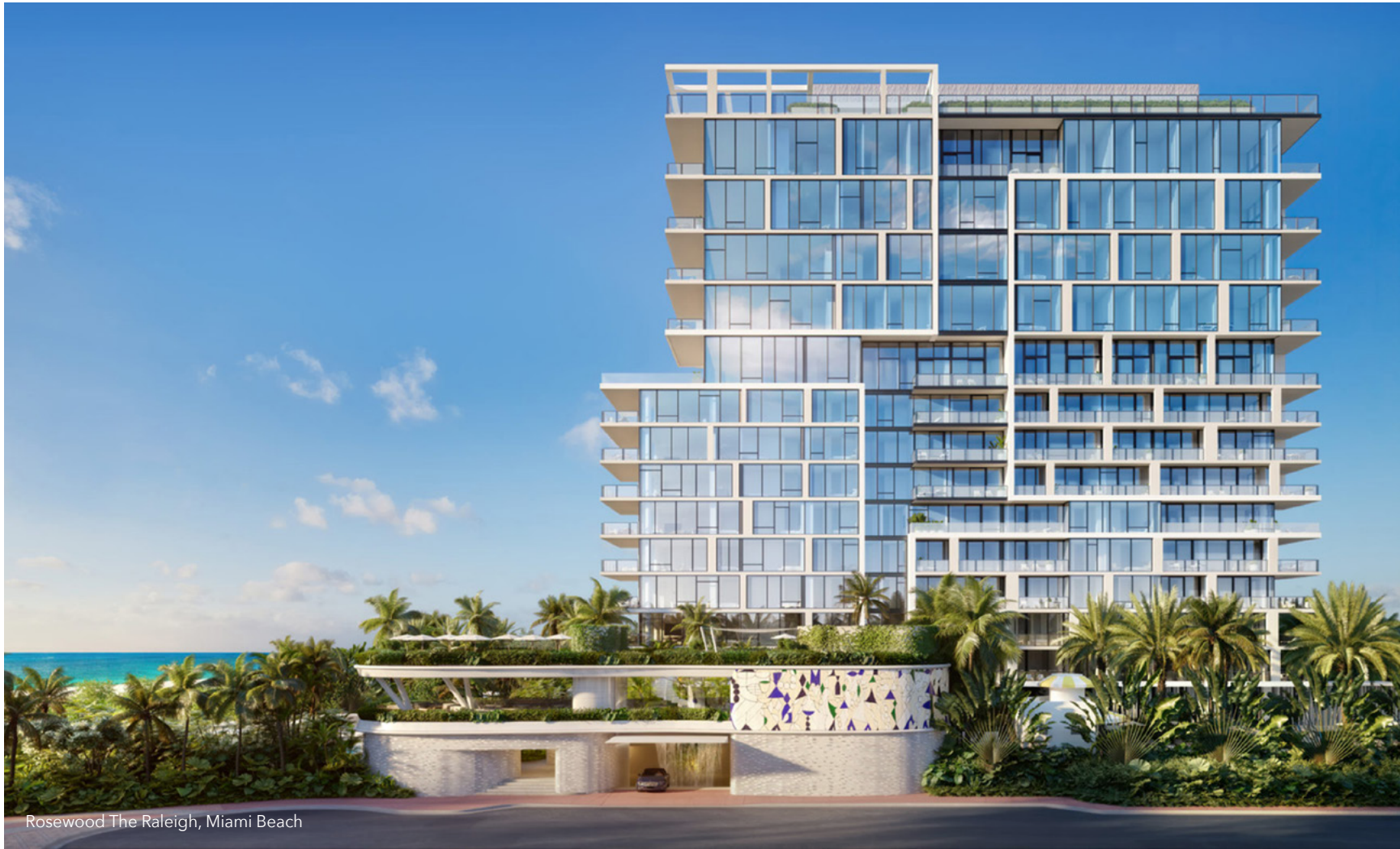
Rosewood The Raleigh, Miami Beach