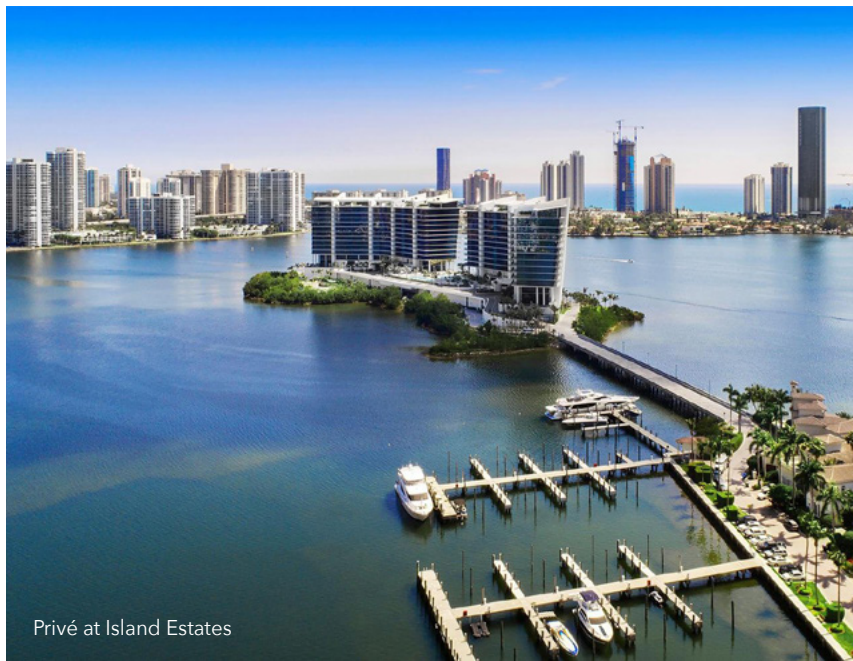
Privé at Island Estates