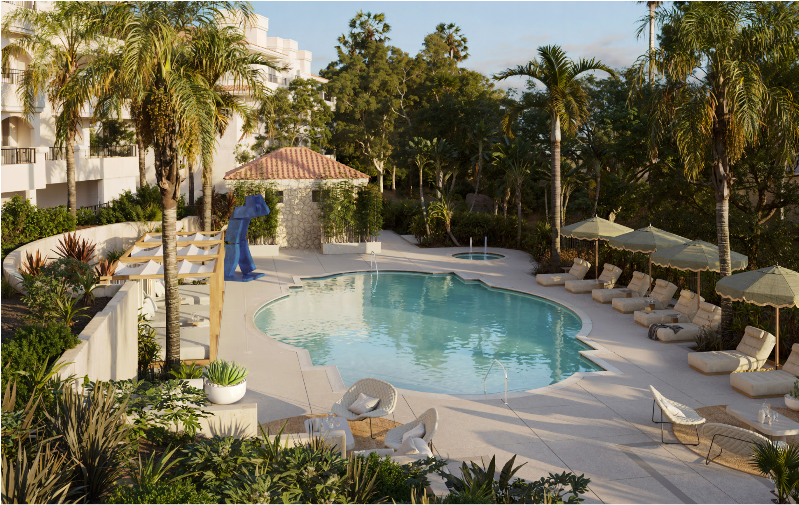
PRIVÉ MALIBU | PRIVATE RESIDENCES