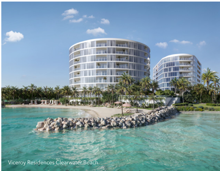
Viceroy Residences Clearwater Beach